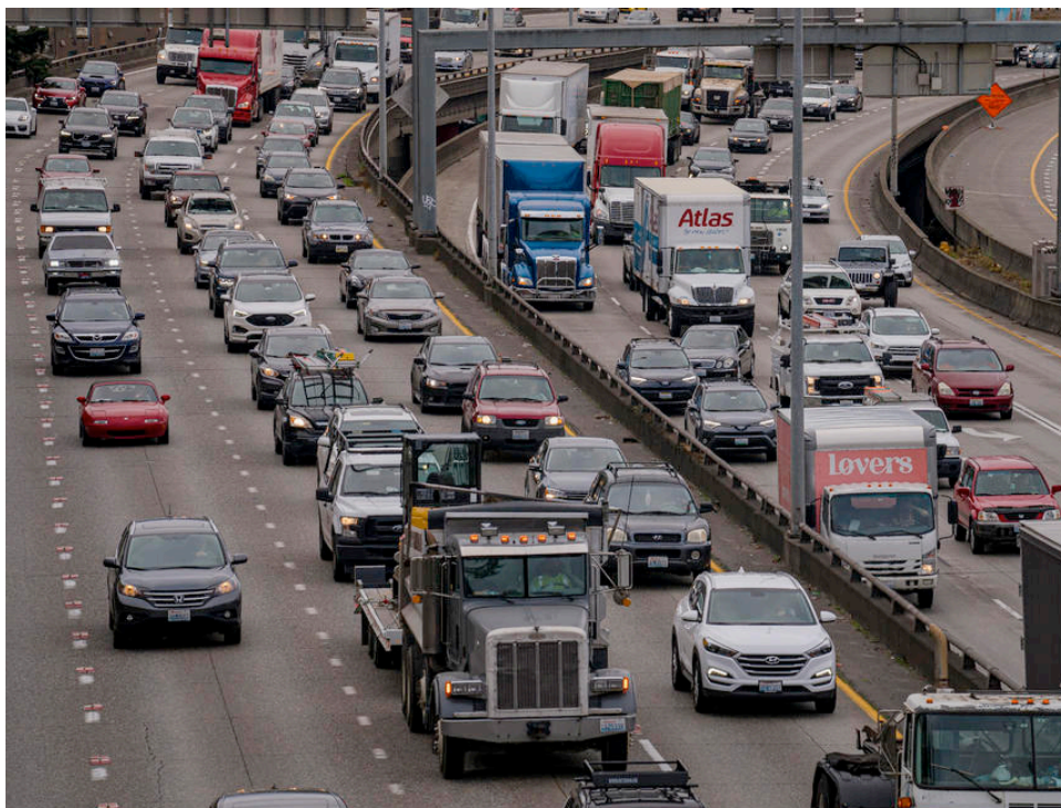
Slow-moving northbound traffic on Interstate 5 on June 30, 2021, in Seattle.

"We've aligned the strategy of our work around the Intergovernmental Panel on Climate Change's 1.5 degrees Celsius carbon budget,"